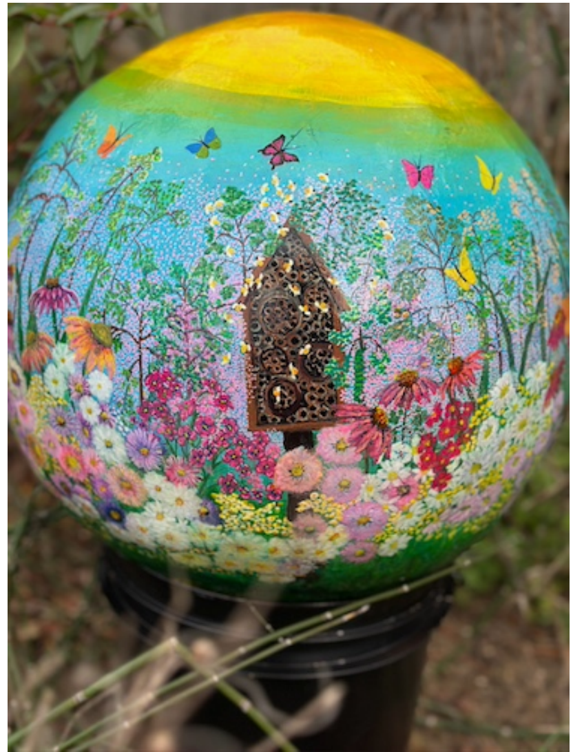
"Bee Sphere, Stone House Village" cement, acrylic paint, paint pens, sealant, 12" round

I worked for a few years before admitting that that too, was a mismatch. Frustrated that my two ideas for careers didn't work out, I decided to take a break from working and stay home with my then-newborn. I have been home with my children for the last 16 years. But in 2018 I began to open the door to art again.