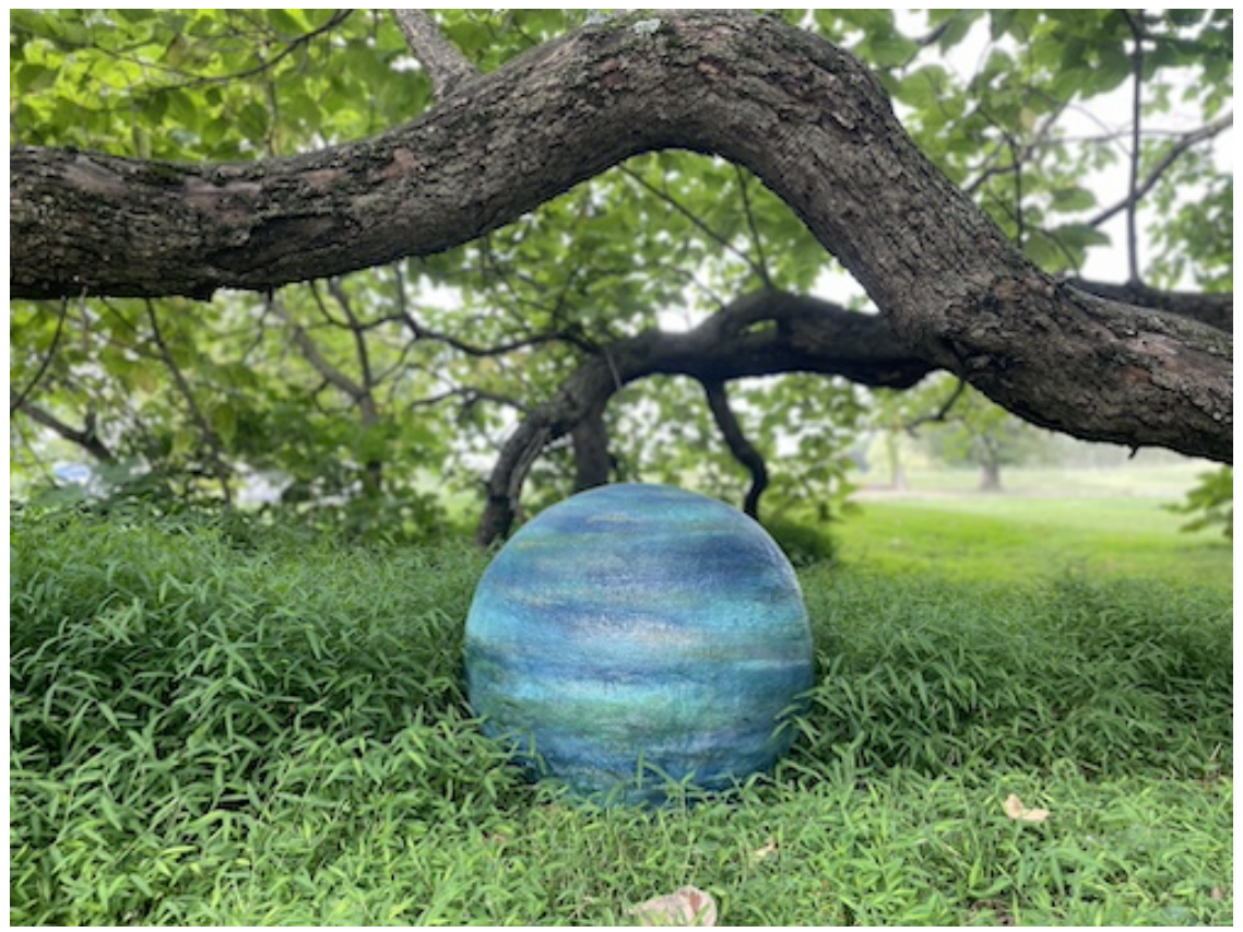
"24-Inch Blue Sphere" cement, acrylic paint, sealant, 24" round