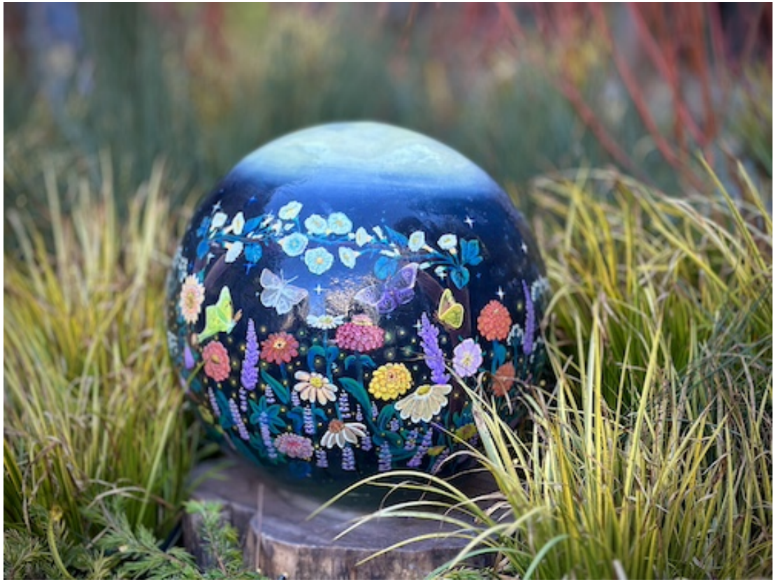
"12-Inch Sphere with Night Garden" cement, acrylic paint, paint pens, sealant, 12" round