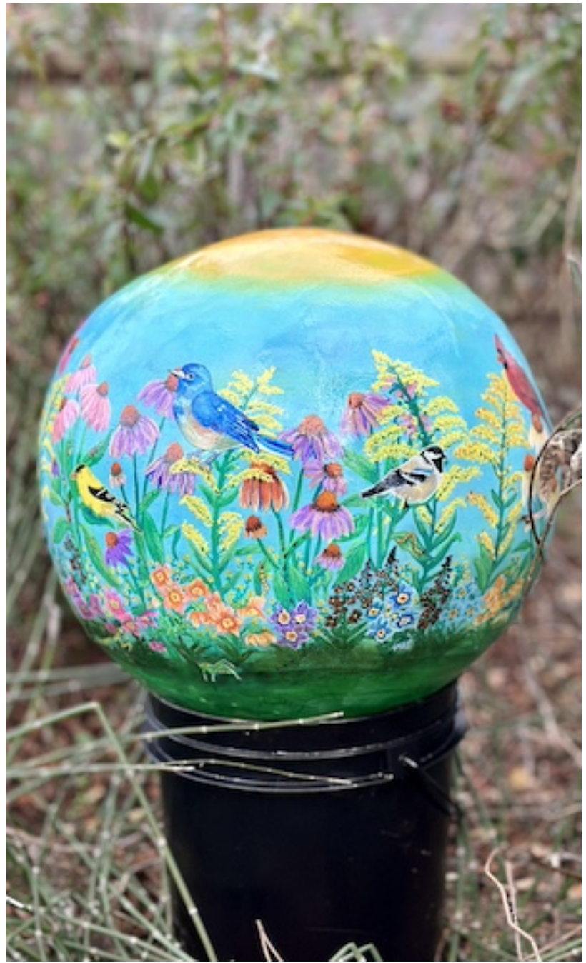
"Bird Sphere, Yellow, Robin, and Brown Birds" cement, acrylic paint, paint pens, sealant, 12" round

In 2021, I began tying together my long-time vision of helping communities and my love for spherical sculptures. Through a climate resilience grant project, I led four community-wide workshops where participants painted images depicting their love for their land. This experience solidified for me what my path is: to impact communities positively through my art form.