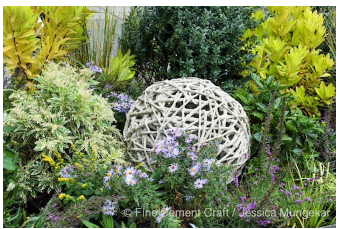
"24-Inch String Sphere" cement, yarn, 24" round