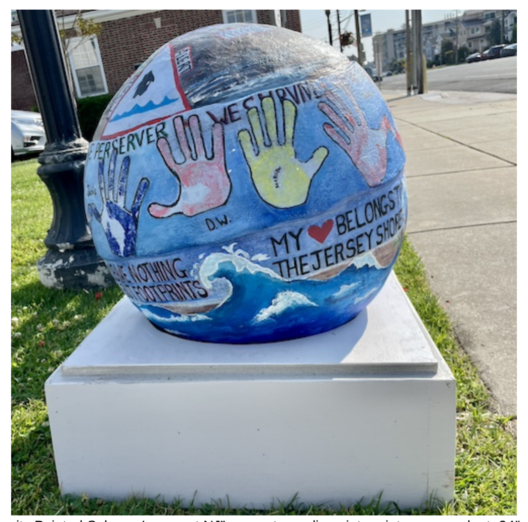
"Community Painted Sphere, Longport NJ" cement, acrylic paint, paint pens, sealant, 24" round

Through contemplation, I discovered the power of the sphere. From that moment forward creating spherical sculptures became the focus of my artmaking.